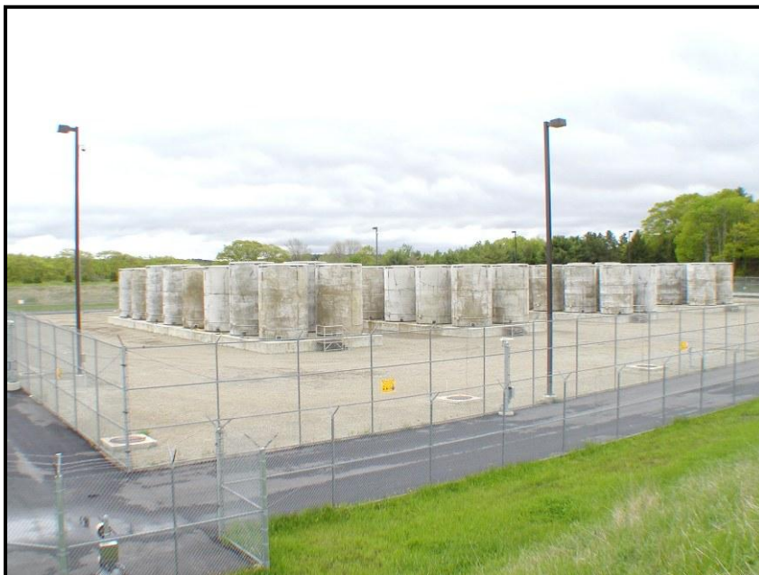
Maine Yankee Independent Spent Fuel Storage Installation (ISFSI)

Spent Fuel and Redevelopment. There are very few examples of commercial redevelopment of decommissioned nuclear power station sites. The exceptions are cases where a nuclear facility has been converted to a natural gas power generating plant, as is the case with the Fort St. Vrain, Colorado reactor site and the Pathfinder, South Dakota reactor site. In both cases natural gas was local and abundant and the conversion of some parts of plant infrastructure made economic sense. A fundamental factor that limits the redevelopment potential of decommissioned sites is the storage of spent reactor fuel on the site, and the related safety and security issues. Unless a permanent storage solution is adopted and executed by the federal government resulting in the permanent removal of spent fuel from the sites, this will remain a barrier.